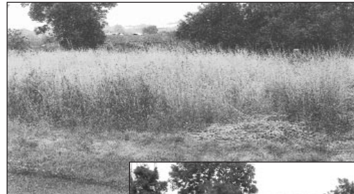
The graveyard before it was partially cleared

“Since the clearance people have started looking after the graves again. I can now see