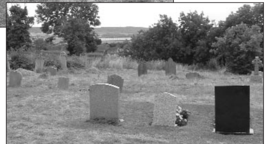
The graveyard since the clearance