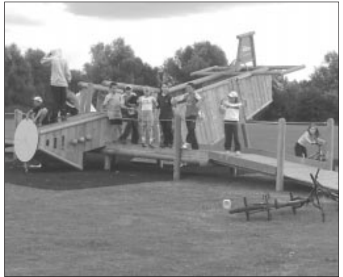
Youngsters playing on the Albatross at Nevill Park.