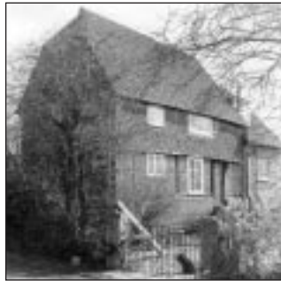
Ham Mill Cottage