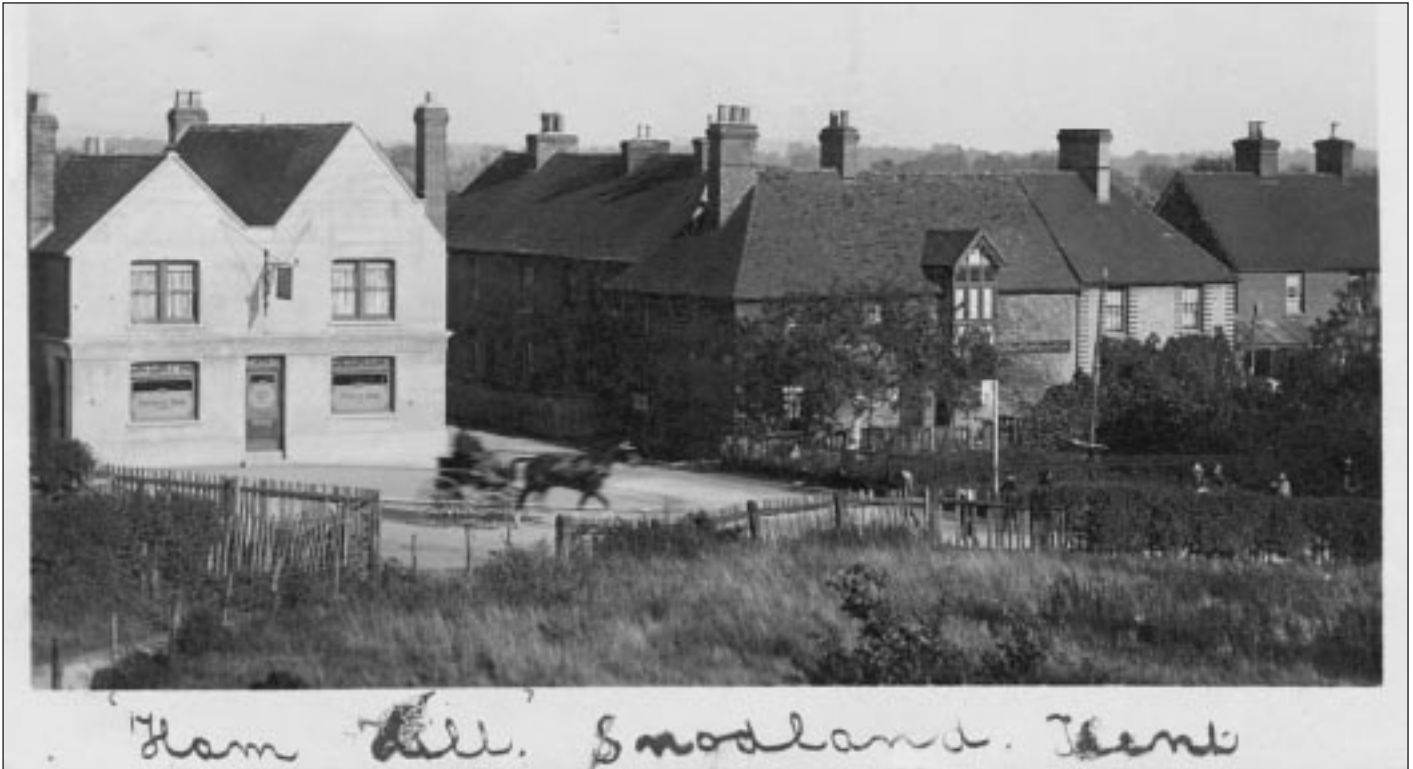
A postcard of Ham Hill in 1909

included two shops, on the west side and Clifton Terrace on the east. Annie Road is a name which also dates from this time, but, apparently, there was little building on it, just a shop.